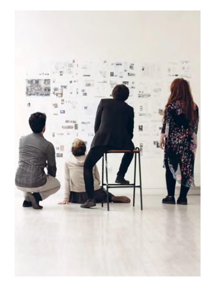
Image: Tutorials in progress in the Grace and Clarke Fyfe Podium Gallery, Bourdon Building, Mackintosh School of Architecture

Guidance on what should be demonstrated in your personal statement, references and uploaded portfolio, as well as the assessment criteria, are outlined on the following pages.