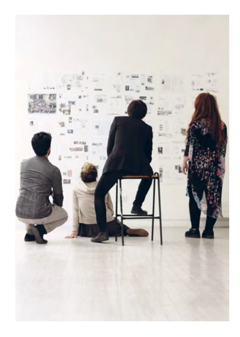
Image: Tutorials in progress. Grace and Clarke Fyfe Gallery, Bourdon Building

Work included in your portfolio should aim to achieve a balance that accurately describes your existing skills and interests. We would recommend that you include at least one completed project as part of your portfolio.